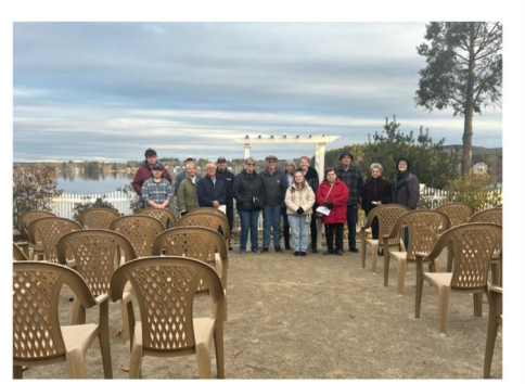
Feed My Sheep Meal Ministry