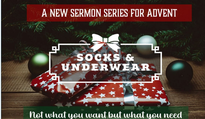
isi uvuu you wani bu uvuu you neeu