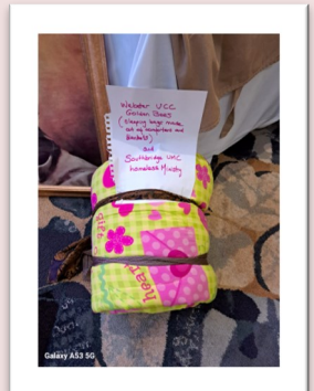
Golden Bees sleeping bag displayed at the United Methodist Church Annual Conference in June