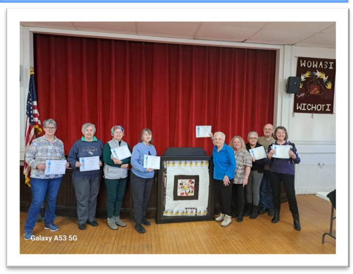
Golden Bees 25th Anniversary Celebration