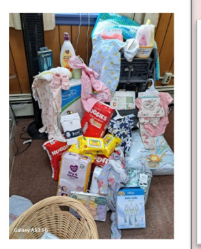
Mother's Day Teen Mom Baby Supplies Drive